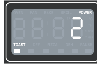
Very light toast