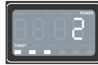
Medium light toast (default setting)