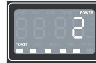
Medium dark toast