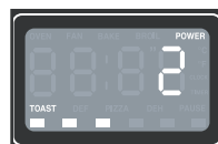
Medium light toast (default setting)