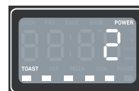
Medium dark toast