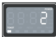
Very light toast

5. When program is complete, the unit will beep continually.