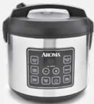
Multicookers/ Rice Cookers