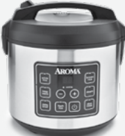
Multicookers/ Rice Cookers