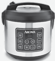
Multicookers/ Rice Cookers