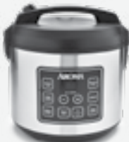
Multicookers/ Rice Cookers