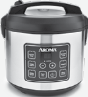
Multicookers/ Rice Cookers